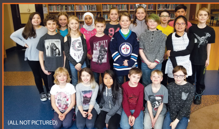
(ALL NOT PICTURED)