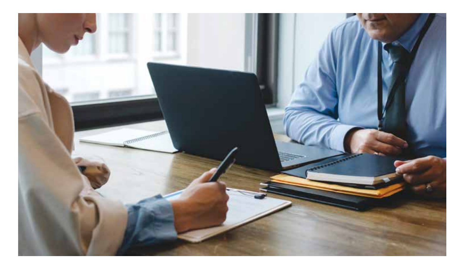
TABLE TOPICS: MTS BARGAINING UPDATE

Negotiations on behalf of Manitoba's 16,600 MTS members are taking place centrally and at tables across the province. Here's the latest news.